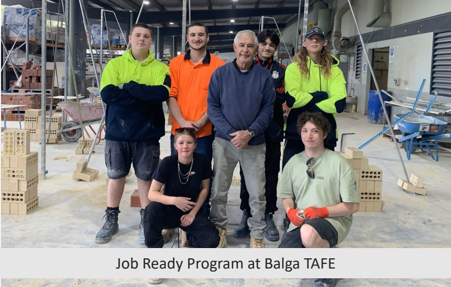
Job Ready Program at Balga TAFE